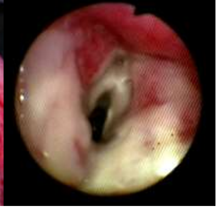
Intra Oral Vocal Cords

Simultaneously, wound debridement was carried out: