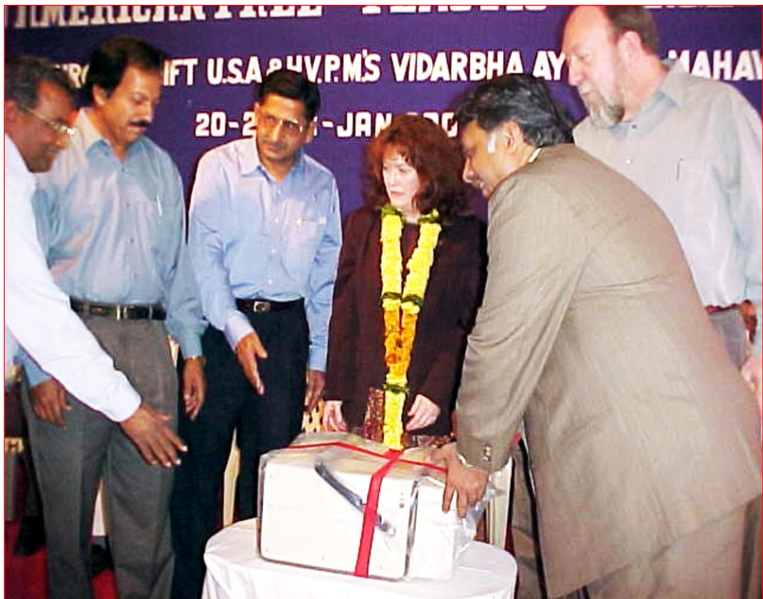
Donating Vital & Expansive Medical Equipments